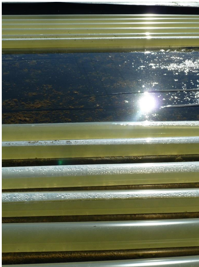
Photo 3. Detail of the photobioreactor's horizontal pipes made of polyethylene with a UV coating