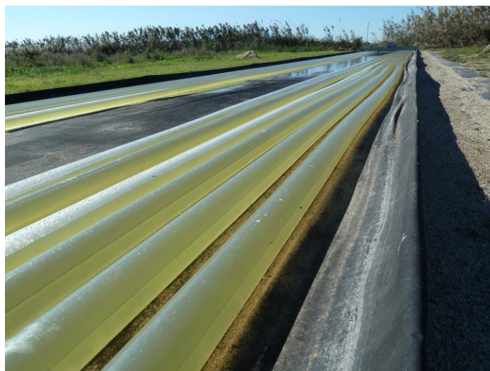
Photo 2. Image of horizontal pipes that make up the return circuit