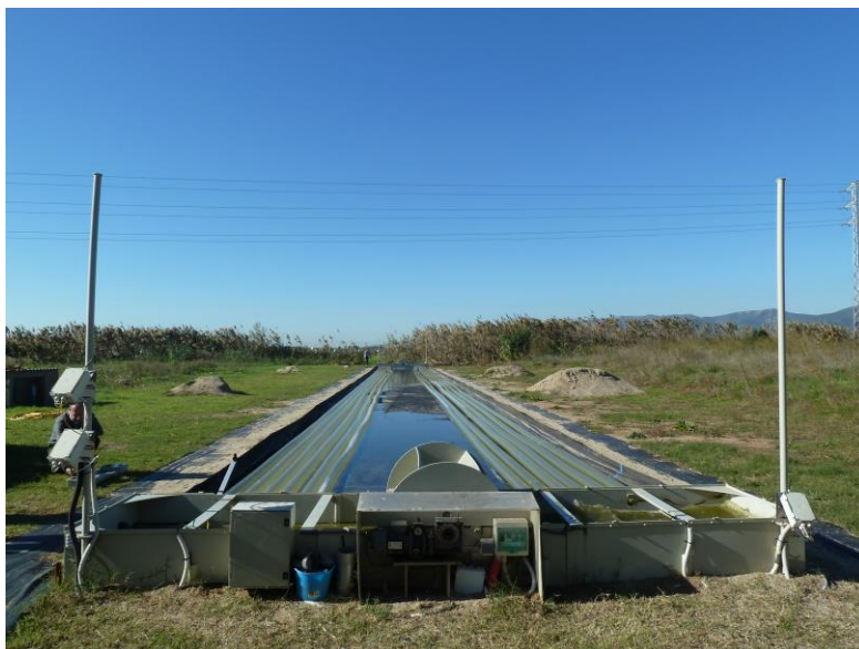
Photo 1. Image of one of the hybrid photobioreactors that will be installed in the Agròpolis

As regards the third line of research carried out in Germany, it does not use algae but yeasts. In this case, bioreactors will be fed with industrial wastewater and will not generate bioplastics but organic acids. Waste from the yeasts will be processed to obtain organic carbon rather than methane and activated carbons rather than organic fertilisers.