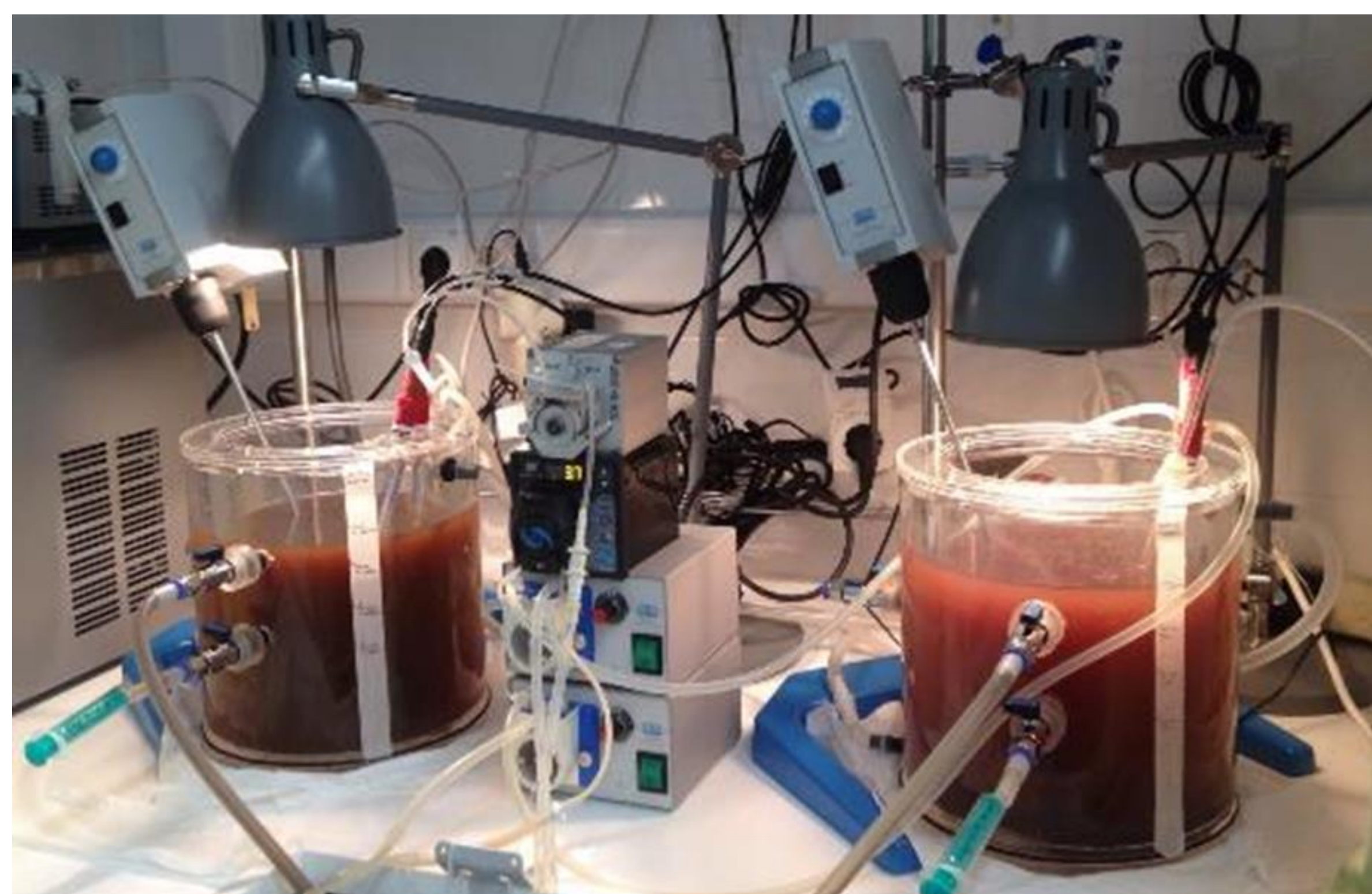
PMC reactors for the INCOVER project using different feeding strategies. Left: permanent feast, simulating a jet mixed algae pond with low sun exposure and anaerobic conditions. Right: feast and famine, simulating a paddle wheel algae pond with higher light availability and aeration.

NoAW aims the conversion of anaerobic digestion agrowaste streams into high-value products: volatile fatty acids (VFAs) synthesized during acidogenesis of manure and maize residues will serve as substrates for PHA synthesis via photofermentation.