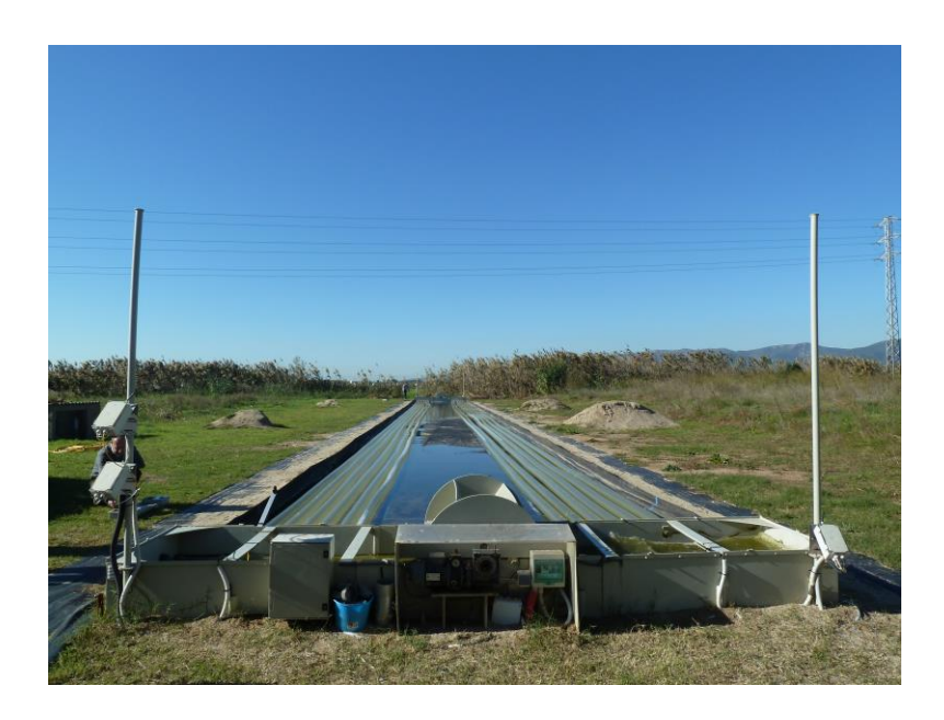
Photo 1. Image of one of the hybrid photobioreactors that will be installed in the Agròpolis

As regards the third line of research carried out in Germany, it does not use algae but yeasts. In this case, bioreactors will be fed with industrial wastewater and will not generate bioplastics but organic acids. Waste from the yeasts will be processed to obtain organic carbon rather than methane and activated carbons rather than organic fertilisers.