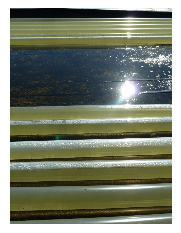
Photo 3. Detail of the photobioreactor's horizontal pipes made of polyethylene with a UV coating